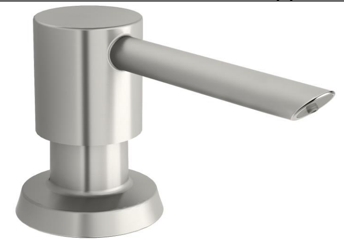
Matte Black (MB)