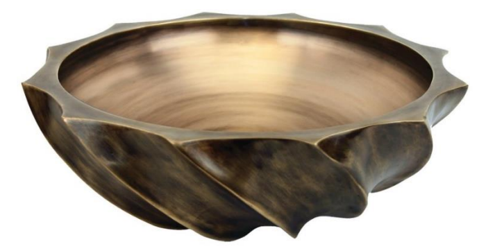
Shown in AB finish