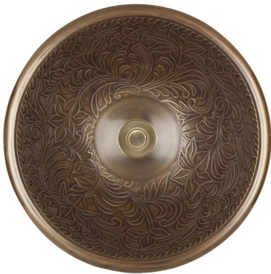
Shown in AB

Linkasink warranties our product to be free from manufacturing defect for the life of the product. Warranty does not cover improper care, neglect or abuse or normal wear-and-tear