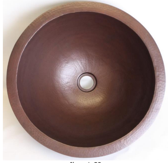
Shown in DB