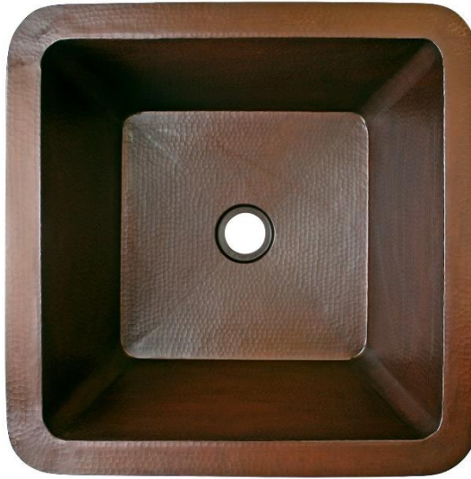
Shown in DB