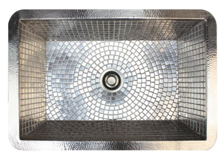
V031 SN with D007 SS Shown