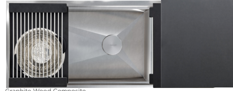
Graphite Wood Composite