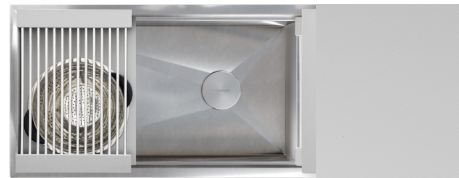
Exclusive Gray Resin*