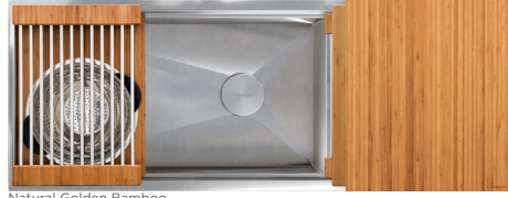
Natural Golden Bamboo